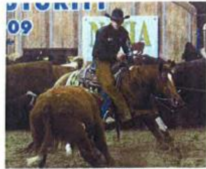
Spins Miss Kitty by Racketeer Cal (imp) from One Moore Spin is the highest selling at Auction daughter at $85,000.

SPINAFLETCH Q-59242 (ROYAL FLETCH Q-51807) 2009 Futurity horse owned by the Belcher family.