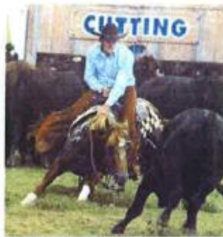
One Moore Senior the highest money earning progeny from One Moore Spin.