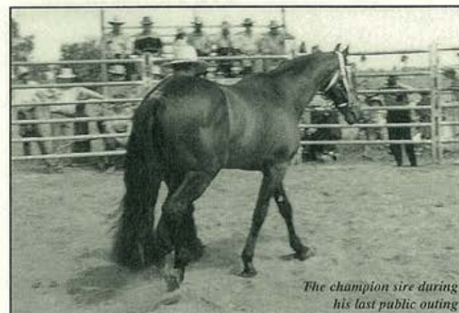
The champion sire during his last public outing